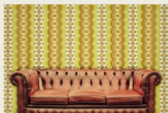
Enhance your chill out area with our sumptuous vintage Chesterfield sofa set, with low tables, lamps and more.