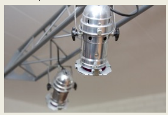
Create your own mood with our great lighting options, which range from basic pin spots to coloured floor lights.