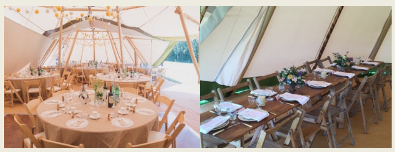
Our gorgeous and versatile reclaimed timber trestle tables are an ideal choice for an elegant or rustic wedding dinning experience. Dress them with table linen or leave them bare, its completely up to you, but either way they are great for maximising space and fit in perfectly with the wooden poles of the tipi. The tables are 2m long and 70cm wide and are great for a vintage themed wedding. They can be matched with our lovely vintage folding chairs. 6ft Round banquet tables and different chair options are also available.