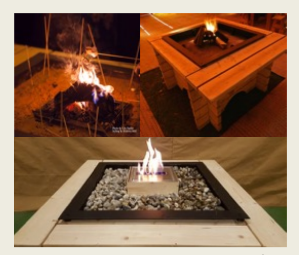
Enhance the warm and cosy atmosphere of our tipis by adding a centre piece Bamse Fire Pit. Supplied with logs or bio-ethanol fuel and fire extinguishers, they are a superb choice of accessory to create a warm ambience.

To obtain that stunning wedding tipi and impress and wow your guests, there is no better way than to include some of our beautiful finishing touches. There are so many ways to dress your tipi and we have some gorgeous accessories that can compliment your vision.